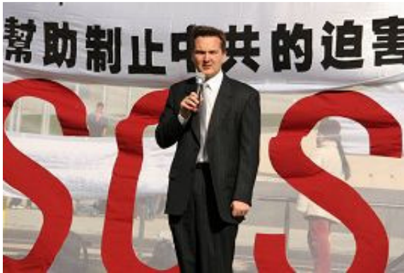
Mr. Chris Bowen, Member of the Australian Parliament

(Clearwisdom.net) Mr. Chris Bowen, Member of the Australian Parliament, recently became a member of the Coalition to Investigate the Persecution of Falun Gong (CIPFG). At a November 1 meeting in Parliament, he put forward the allegation of the Chinese Communist Party's (CCP) organ removal from living people and discussed the independent investigation report from Mr. David Kilgour and Mr. David Matas. Mr. Bowen called on the Chinese government to allow independent investigators to enter China to conduct investigations into the allegations, and called on the Australian government to support the investigation. The CIPFG issued notice on October 20, 2006 to immediately organize a team to enter China to investigate the persecution of Falun Gong practitioners, especially the CCP's organ removal from living practitioners.